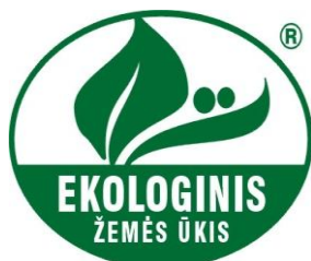
Figure 1. Eco-label “Ekologinis žemės ūkis” (“Ecological Farming”)

As demand for organic products has been increasing for the past decade, a certification system had to be put in place in order to differentiate and acknowledge organic farms and products. Since 2008 in Lithuania the public enterprise “Ekoagros” has a permission to certify agricultural and food products of exceptional quality and processes of organic production. It issues the “Ekologinis žemės ūkis” (“Ecological Farming”) eco-label since 2009, and since 2012, it is issued along with the EU “Euro-leaf” organic logo (Ekoagros, n.d.). “Ekologinis žemės ūkis” (“Ecological Farming”) is the newest label that has been used by eco-farmers and processors for agricultural and food products (Fig. 1).